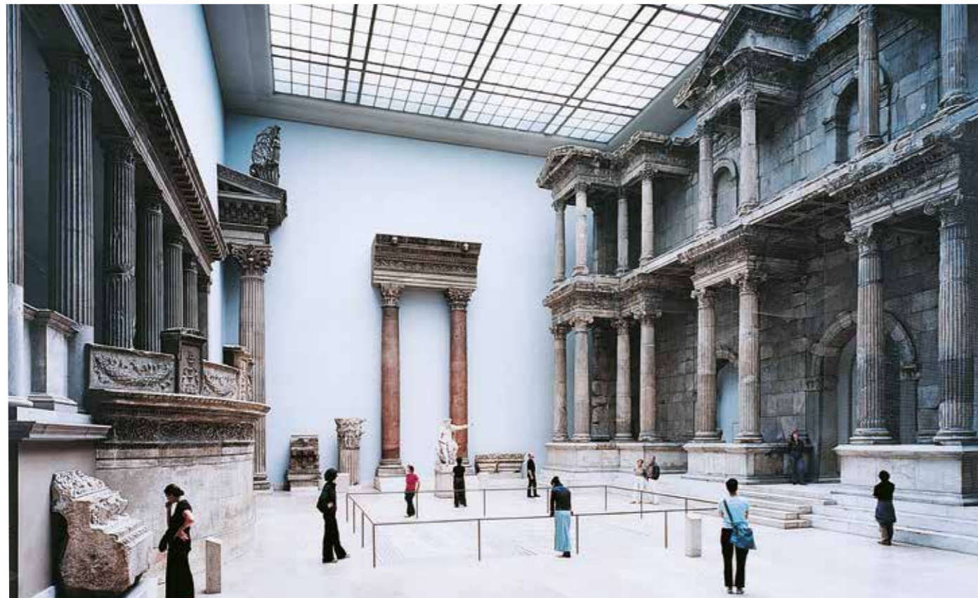
STRUTH, Thomas. Pergamon Museum 2, 2001