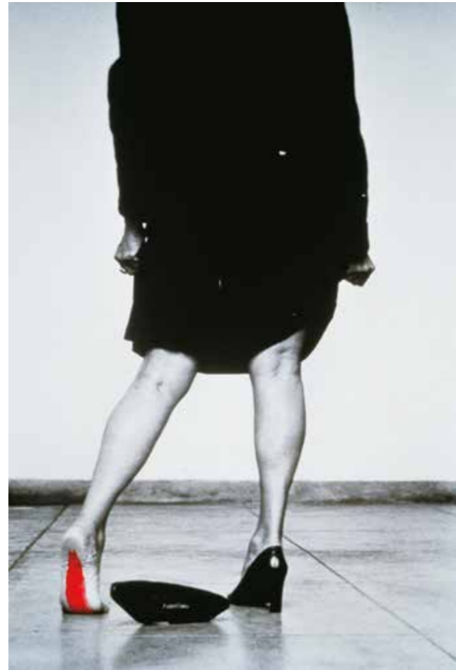
ALMEIDA, Helena. Seduzir (#9), 2002